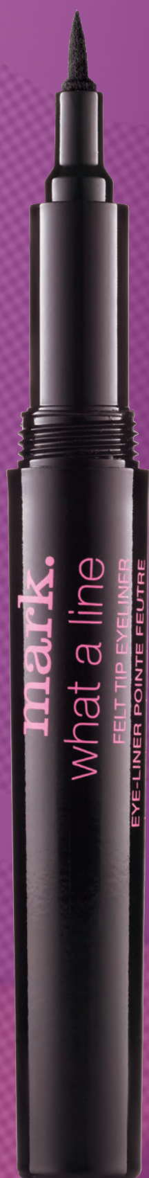
WHAT A LINE FELT TIP EYELINER PG 40