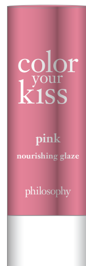
primary lid matte metallic