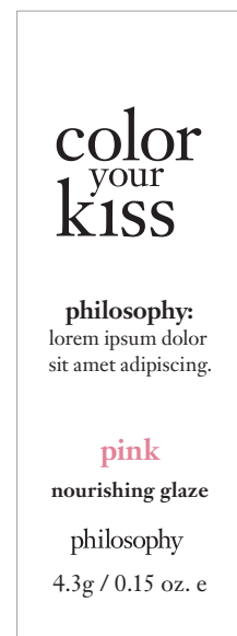
secondary opaque white front, matte metallic top