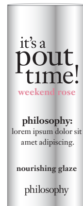
barrel interior matte metallic