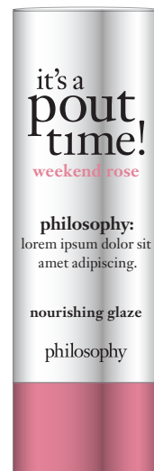
primary lid matte metallic