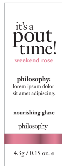
secondary opaque white & matte metallic front, opaque white top